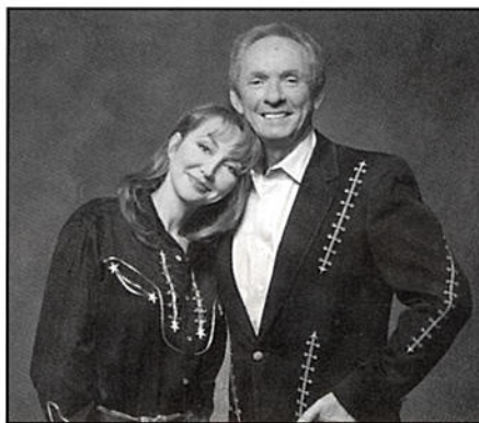
Tillis with daughter, Pam Tillis, 1994 Country Music Awards Female Vocalist of the Year.

went, even putting together a band in the Air Force to entertain the troops.